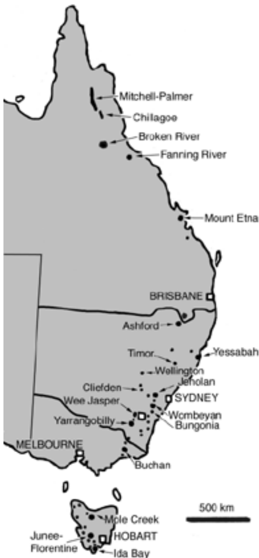
Fig 1. Karsts in Palaeozoic Limestones of Eastern Australia

Small impounded are common in the Palaeozoic fold belts of eastern Australia (Fig 1).